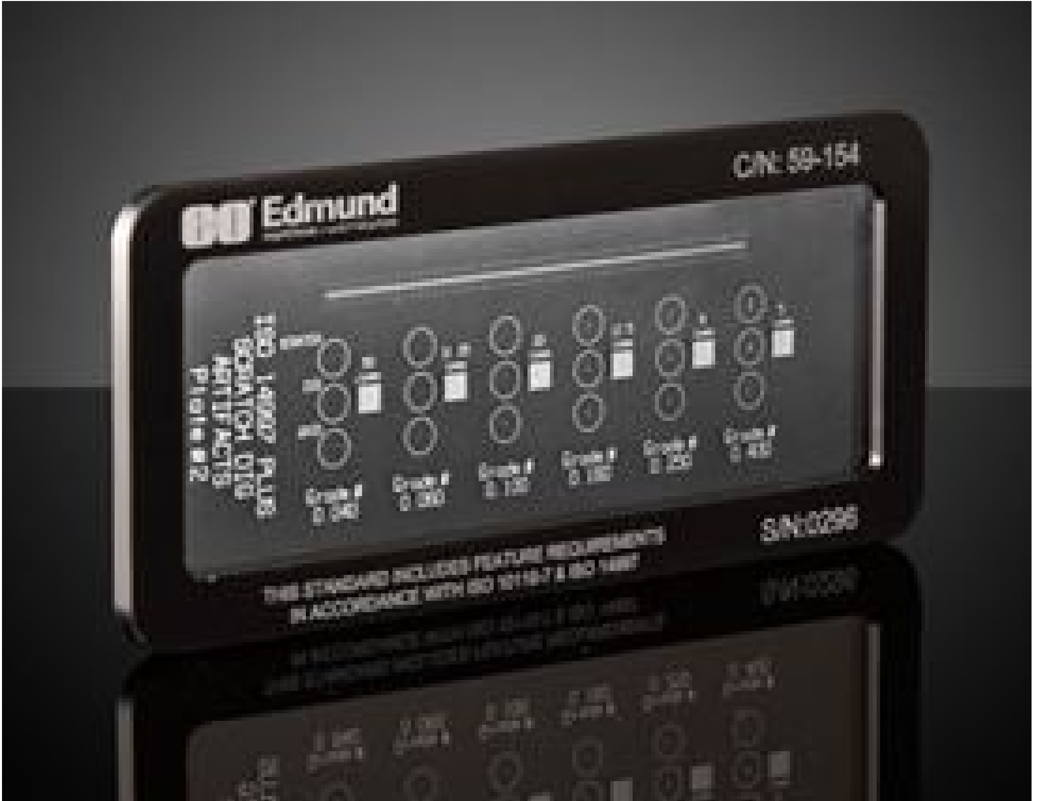
Scratch & Dig Target (1st Surface Positive), #59-154