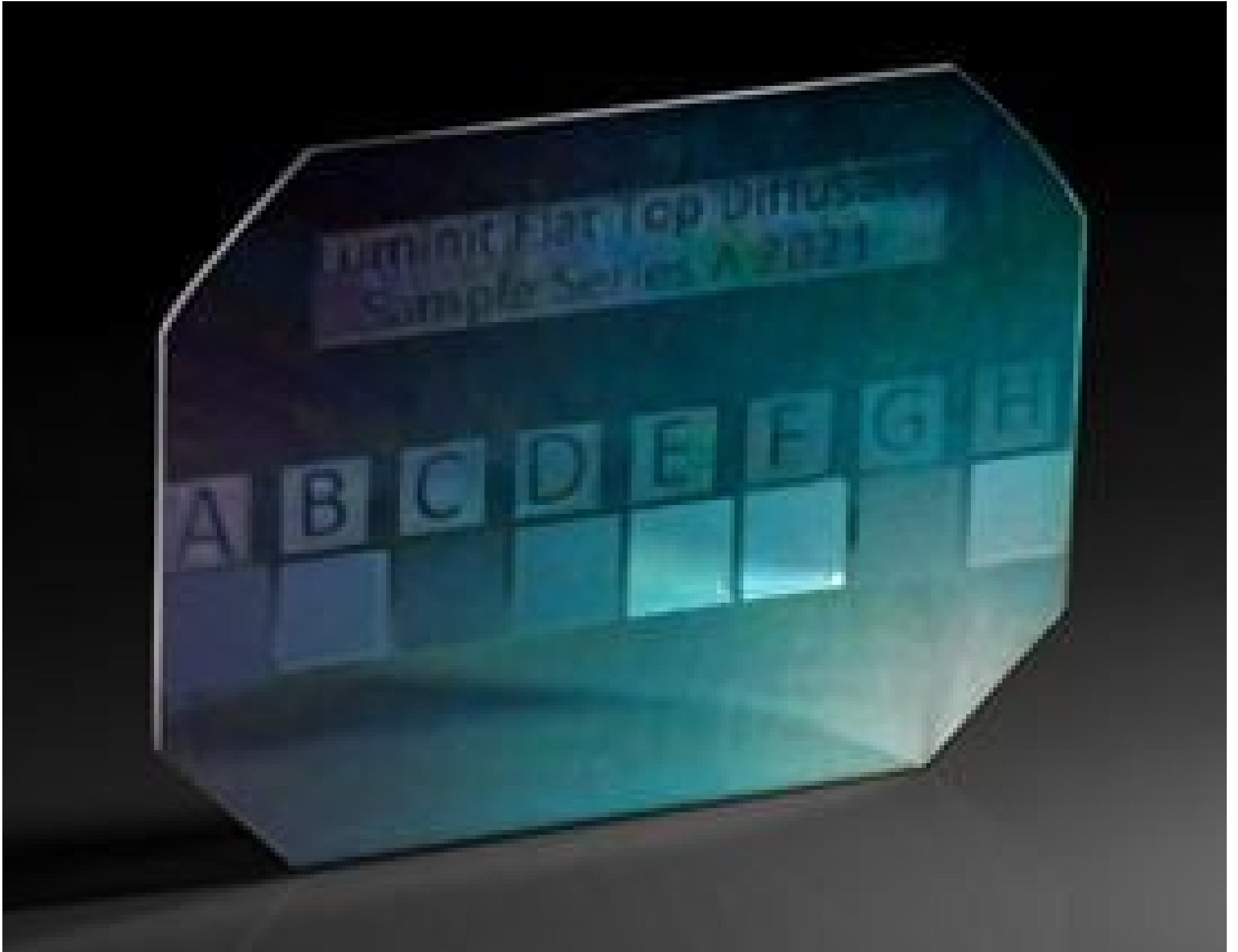
Flat Top Holographic Diffuser Sets