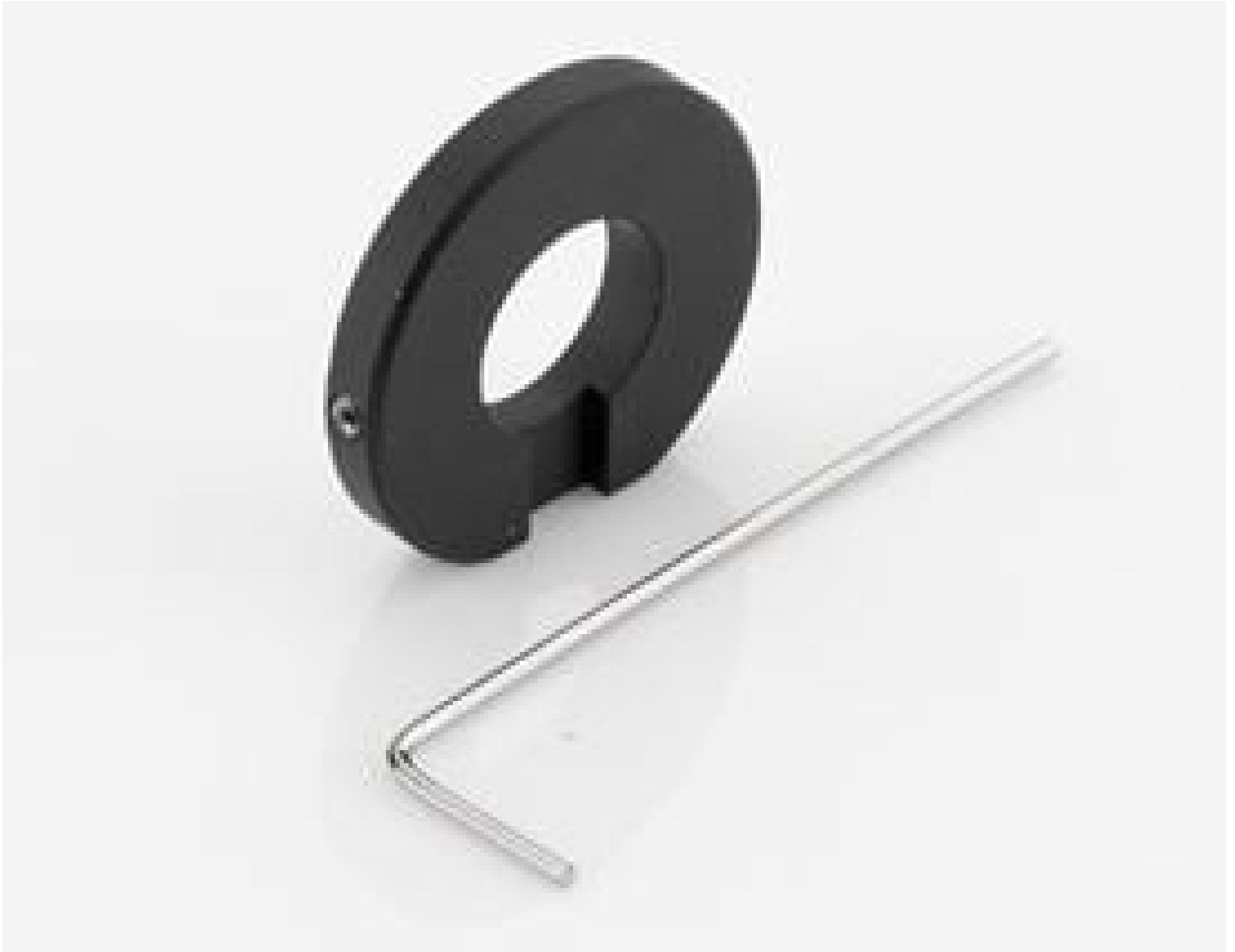
#33-675: Small Liquid Lens Holder for 35mm Cx Lens