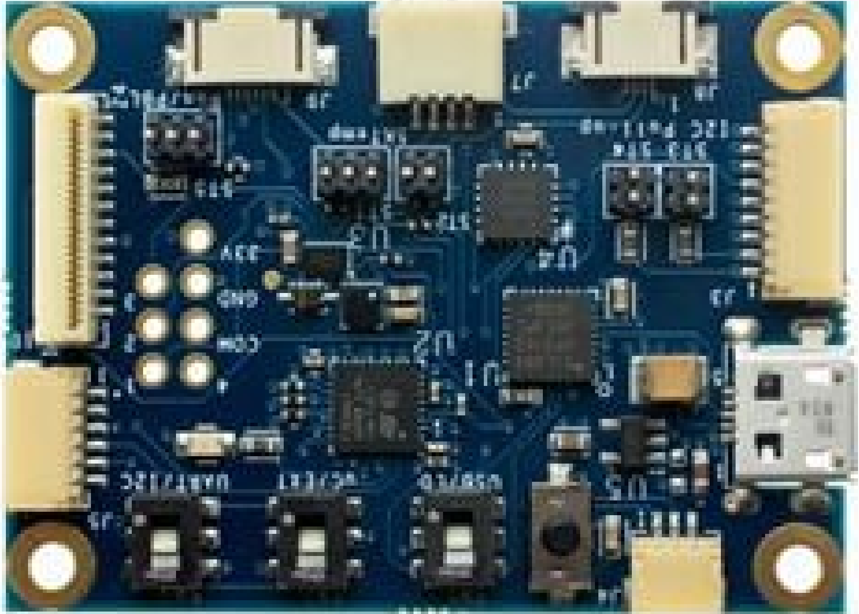
USB-M Universal Driver Board